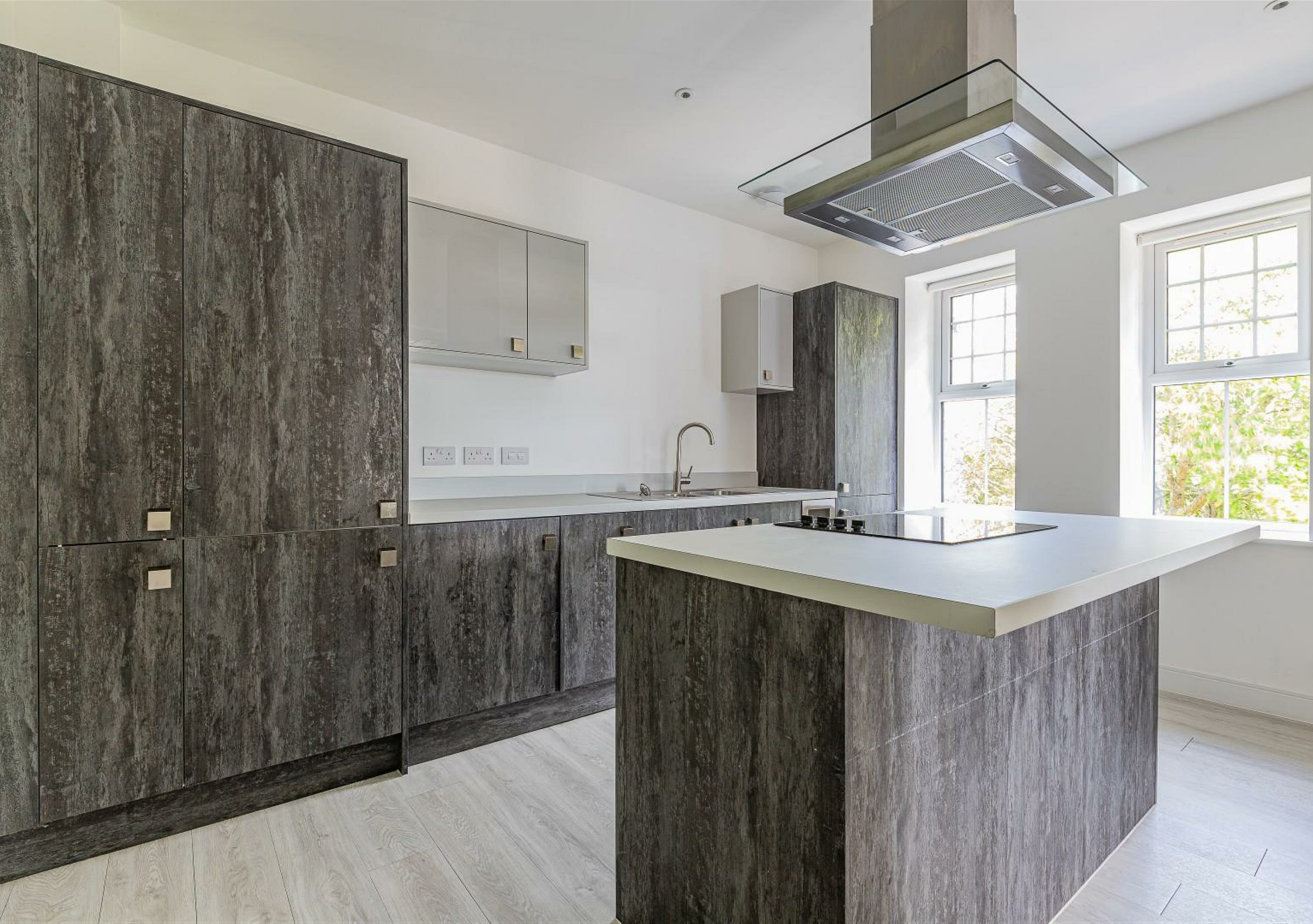
3 Lozelles Block C